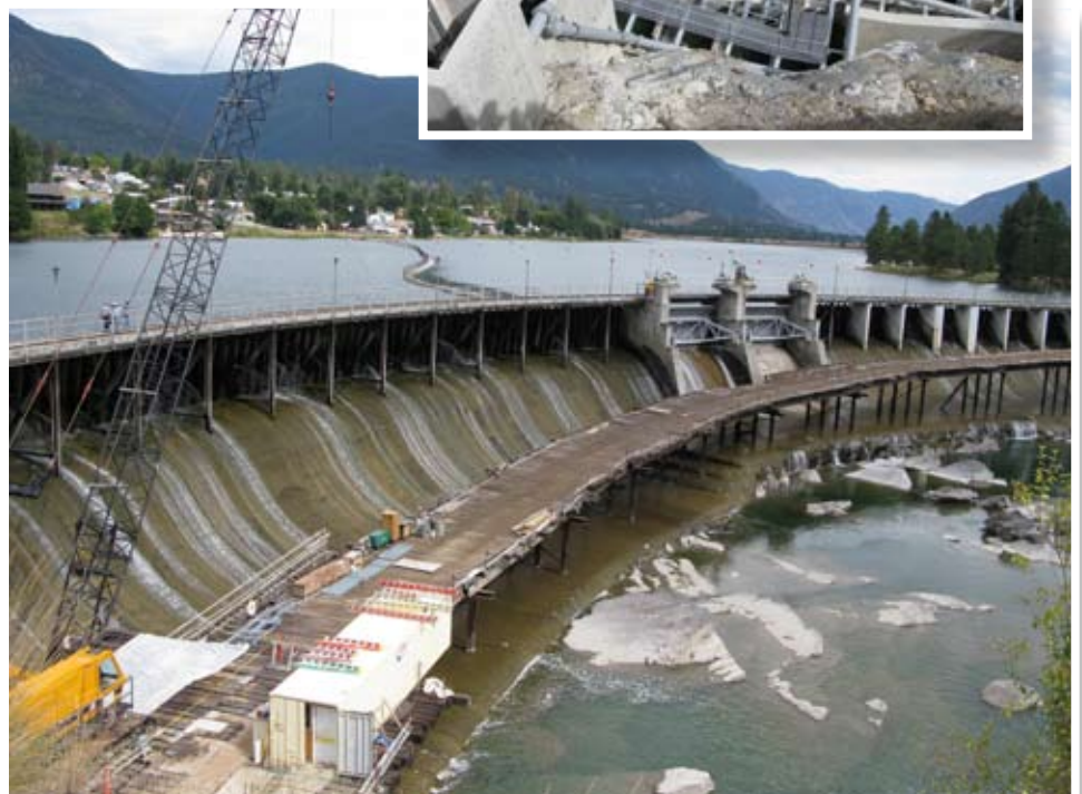
Native trout get a lift at Thompson Falls.